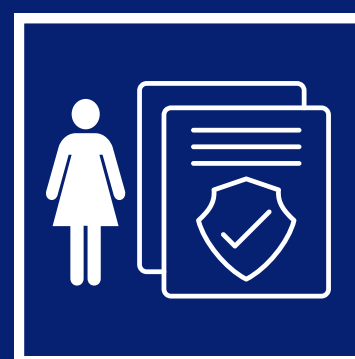
Policies that support women leadership